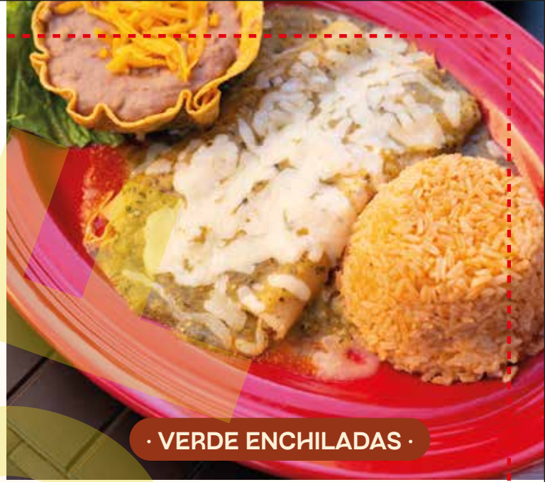
· VERDE ENCHILADAS ·

Two enchiladas finished with our smooth, decadent cream sauce and cheddar cheese. 16.00