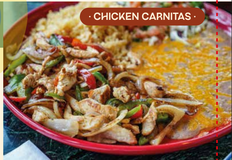
· CHICKEN CARNITAS ·

Food allergy notice: If you have a food allergy or a special dietary requirement, please inform your server and we will do our best to accommodate your needs. While we try to keep things separate, we cannot guarantee that any item is 100% allergen free.